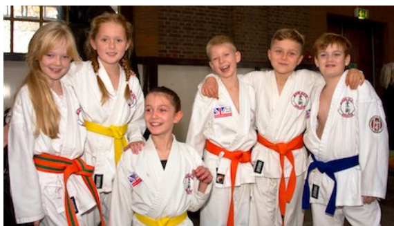
Some of the 2016 Competition Team

Prices for training: £ 5.00 per session.